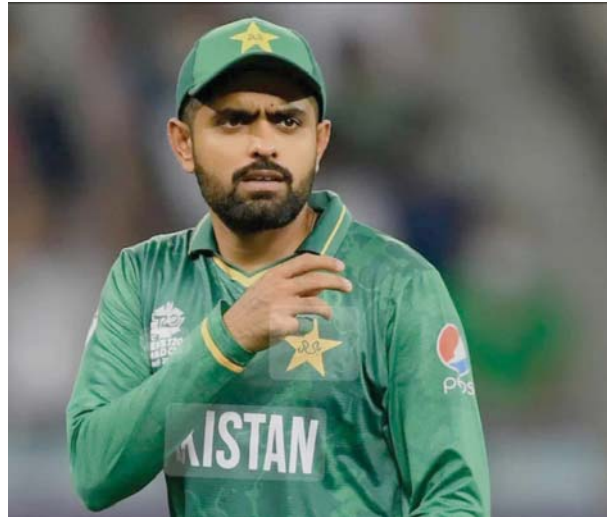
the team as a player and I'm fully committed to that path. The team's success is what matters most.

stan cricket. He believes that dedicating himself fully to his batting will enable him to play a more decisive role in the team's success in the shorter formats. The PCB acknowledges Babar's contributions as white-ball captain, his ability to prioritise the team's needs and his unwavering dedication to Pakistan cricket. The PCB will continue to support Babar Azam, recognising he still has much to offer both as a world-class batter and a senior statesman of the team. Babar Azam Playing for Pakistan has always been my greatest honour and I've always placed the team's success above everything else. Stepping down as captain will help me deliver even more for