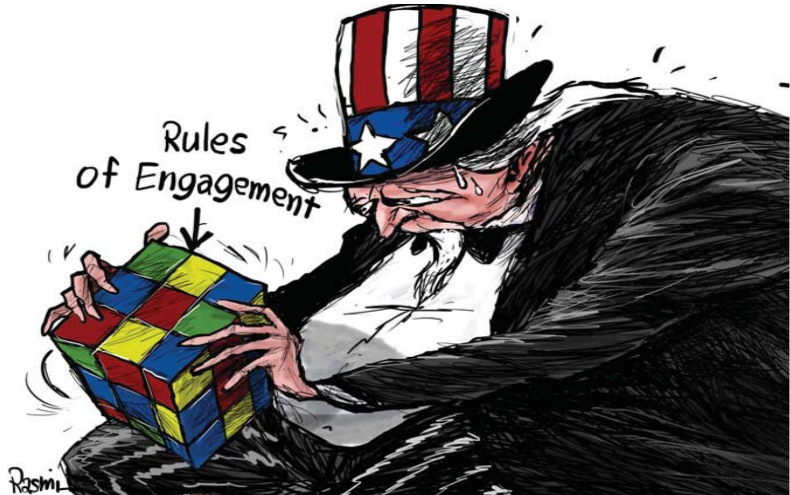
Cartoon by Amjad Rasmī. (Courtesy of Ashraf Al-Azcat)

It seems that Iran's usual pragmatism could not prevail this time, as the regime must feel that its back is against the wall. The choice to retaliate directly against Israel could surely lead to severe consequences for the regime's future, as Israel, with the US behind it, has pledged to hit back forcefully.