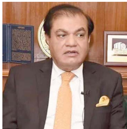
Talking to the business community, the...