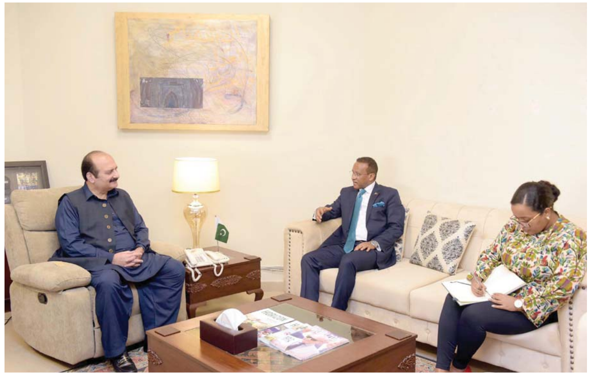
development in Ethiopia under the leadership of H. E. Dr. Abiy Ahmed, Prime Minister of the FDR Ethiopia.