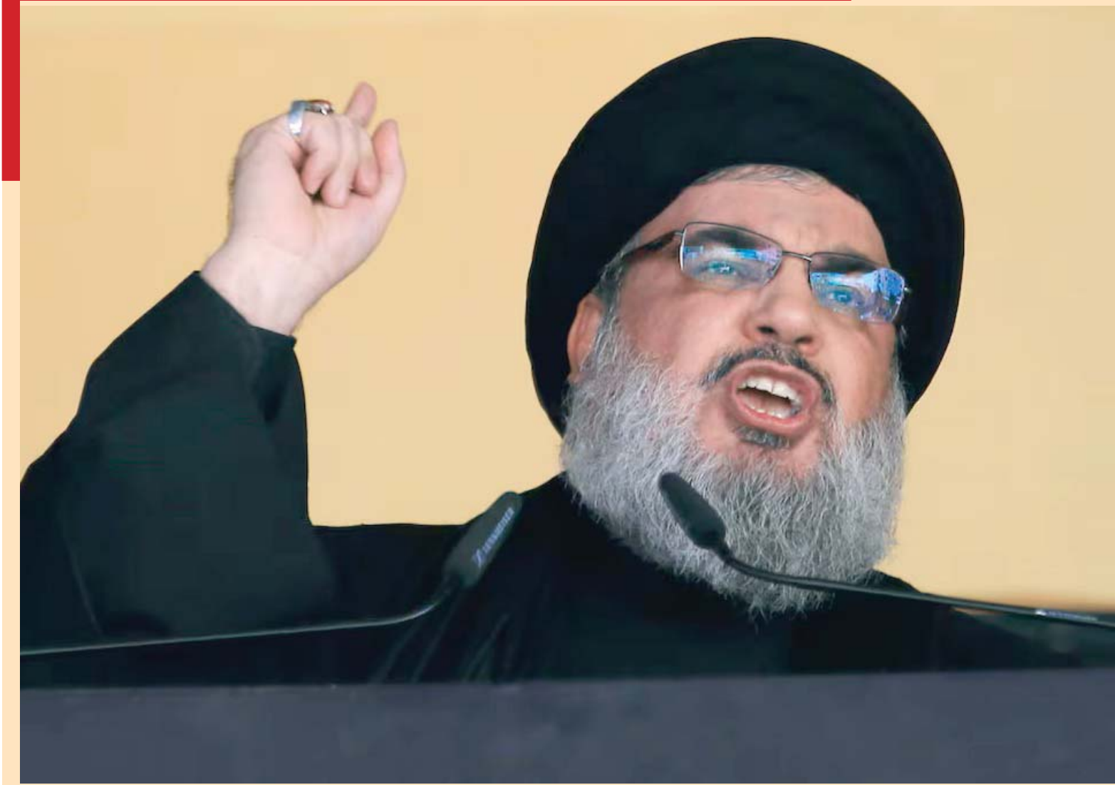
Hezbollah leader Hassan Nasrallah, File Photo via X