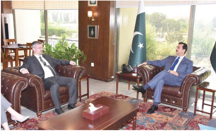
parliamentary diplomacy in fostering connections between the two nations.

Chairman Gilani emphasized that Pakistan values its bilateral relations with Russia and is eager to enhance collaboration across various sectors, including trade and the economy. He highlighted the significance of