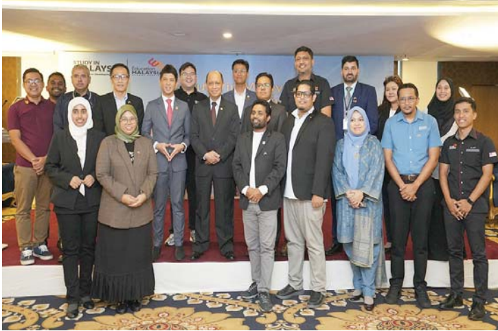
UCSI University, INCEIF University, Multimedia University (MMU), University Kuala Lumpur (UniKL), University Tunku Abdul Rahman (UTAR), University of Cyberjaya (UoC), University Teknologi Malaysia (UTM), University Kebangsaan Malaysia (UKM) and University Malaya (UM). Visitors to the fair will have the