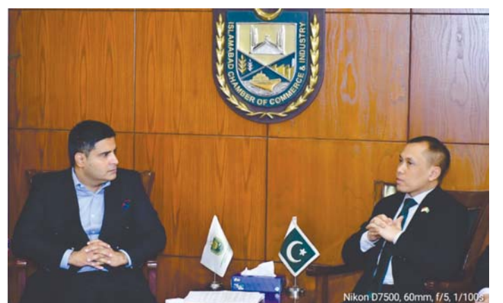
Nikon D7500, 60mm, f/5. 1/100s