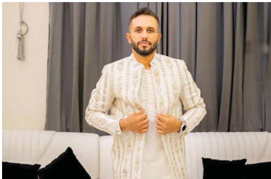
stan Shaheens for two 50-over matches and the Top End T20 series, between August 4 and 18 in Darwin, Australia. The wicketkeeping batter has also captained Pakistan