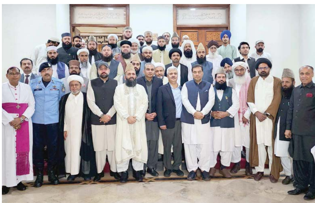
ISLAMABAD: Federal Minister for Interior Mohsin Naqvi and Federal Minister for Religious Affairs Chaudhary Salik Hussain in a group photo with a delegation of scholars and religious leaders on Friday.