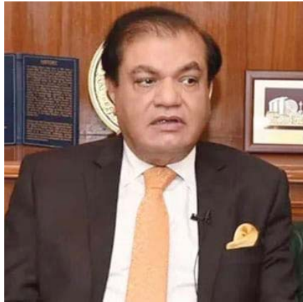
accelerates, terrorism also accelerates, which shows who is pulling the strings of the terrorists.

Talking to the business community, the veteran business leader said that enemies want to frustrate China, which should not be allowed. He said that whenever the CPEC project