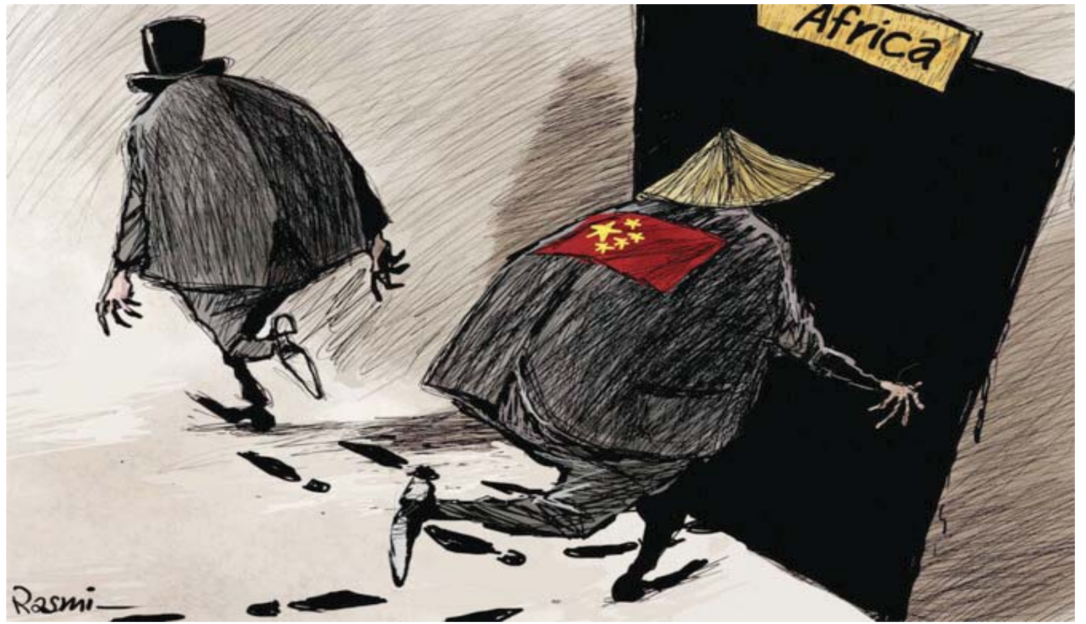
Cartoon by Amjad Rasmi.