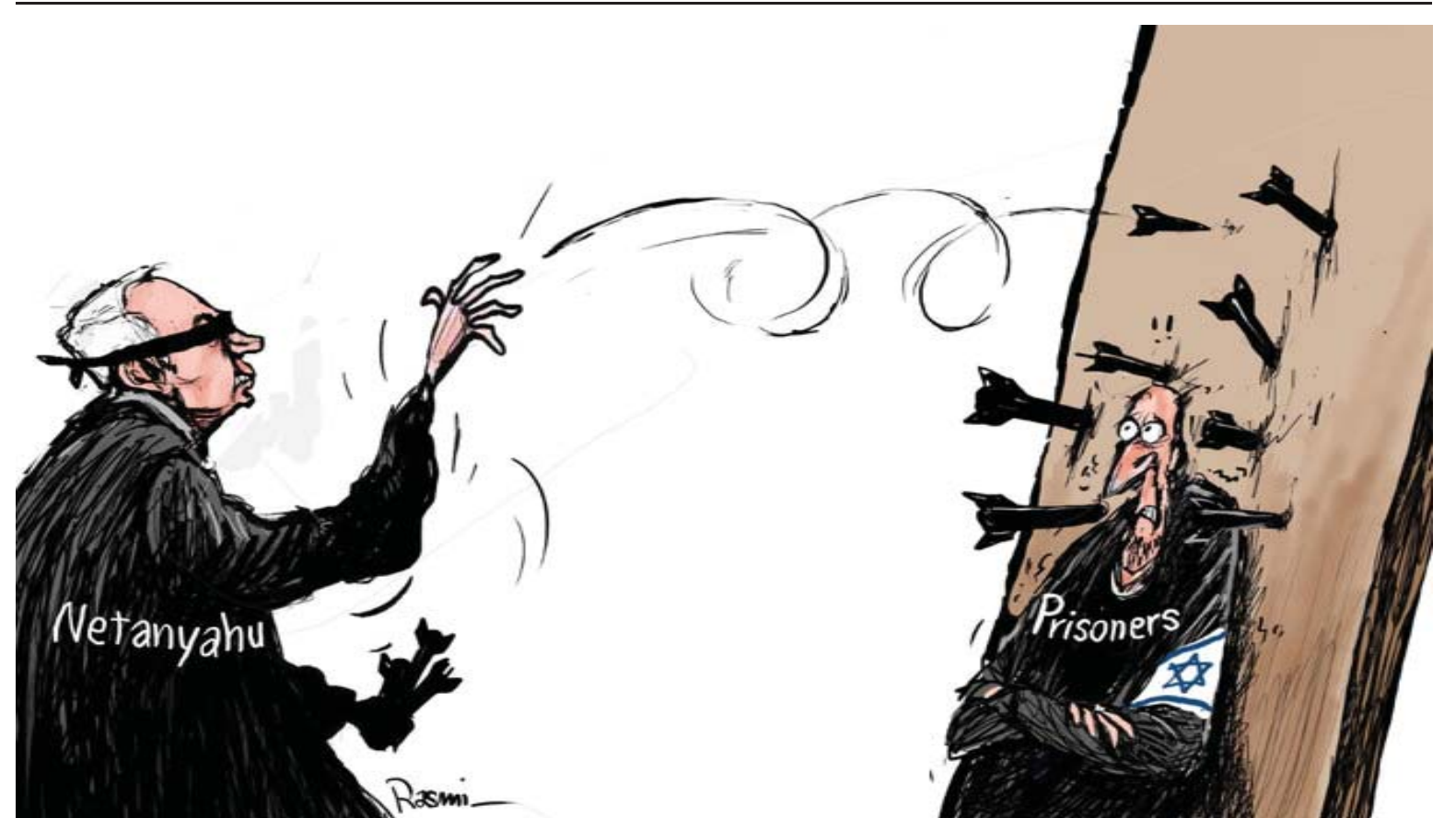
Cartoon by Amjad Rasmī.

Defense, Air Force, and Navy Days in Pakistan are not just commemorations of historical events but serve as powerful reminders of the collective responsibilities and values that sustain national security and unity. These days highlight Pakistan's resilience and military strength during the 1965 Indo-Pakistani War, and their significance goes beyond historical reflection. They call for a unified response from the nation, emphasizing the need for solidarity, awareness, and active participation in maintaining national security. These observances honor the services of the armed forces and pay tribute to our martyrs, ensuring that the nation stands united and resolute in defending the country. The days reinforce the nation's commitment to security and defense, rejecting anti-state elements and false propaganda, and demonstrating unwavering support for the armed forces in addressing both internal and external threats.