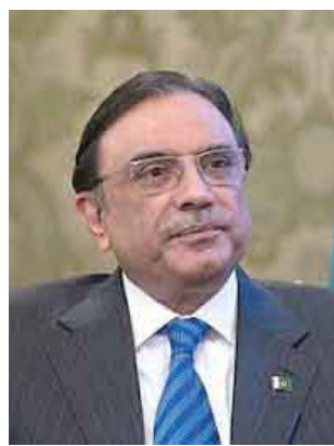
the just cause of the Kashmiri people will forever be etched in

In a message, the president pointed out that Syed Ali Geelani was a beacon of hope and resistance, inspiring countless Kashmiris to stand firm in their quest for self-determination. "His tireless efforts and sacrifices for