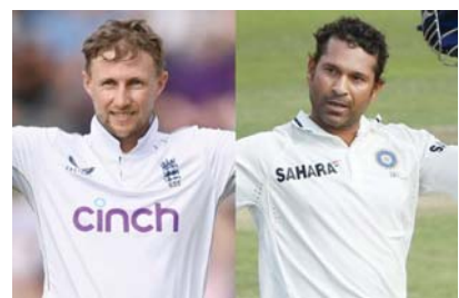
He was asked if he is keeping an eye on breaking Tendulkar's record after scoring his 34th Test hundred, however, the right-hander stated that he prefers to keep team

and West Indies' Brian Lara. Root, who recently amassed 12,000 runs in Test cricket to become the seventh-highest run-scorer of all time, has second-placed Ponting and Tendulkar's overall record within sight. The English batter has scored 12377 runs, meanwhile, Sachin Tendulkar is leading the list with 15921 runs. With Root being 33 years old and 3544 runs away from Tendulkar's record, it's been discussed among cricket circles that he has a realistic chance of surpassing the Indian legend as the highest run-scorer in Test cricket.