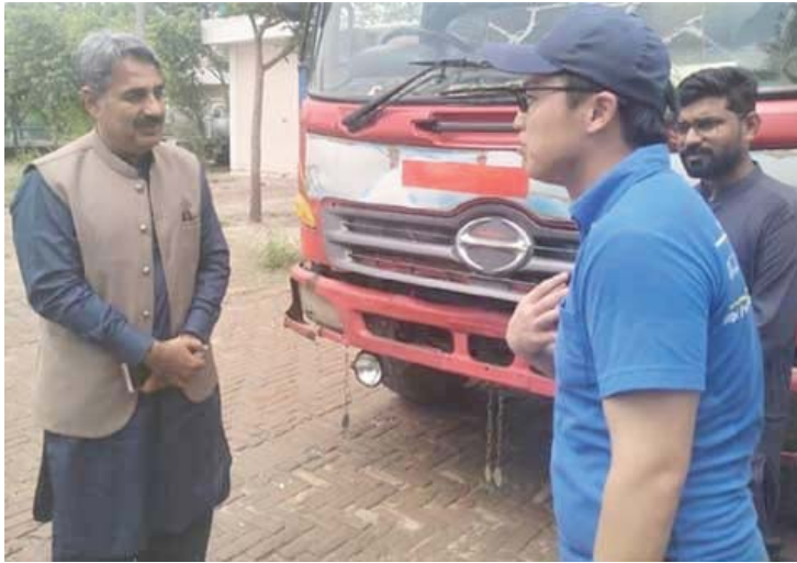
in the project of supplying modern machinery to Wasa Multan.

There is an urgent need for projects, while he said that the friends of the country are very grateful for the cooperation of the Japan International Cooperation Agency (JICA)