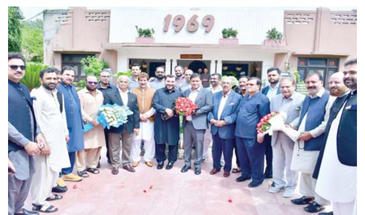
for the ICCI.

Women Chamber as ineffective for the past 10 years for their personal gains. The Women Chamber's Election Commission had issued an official schedule, but nomination papers were not provided to anyone by the set deadline of August 21. However, on August 23, the individuals responsible for sinking the Sarhad Chamber and the business community committed severe nepotism and fraud by installing their favored woman as the president of the Women Chamber. This act has been strongly condemned by the entire business community and women of Peshawar.