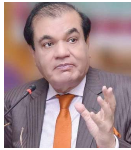
policies, which may threaten the employment of millions of people.

Similarly, the future of cement, automobile, steel, sugar, textile, and other industries also looks uncertain due to the current energy