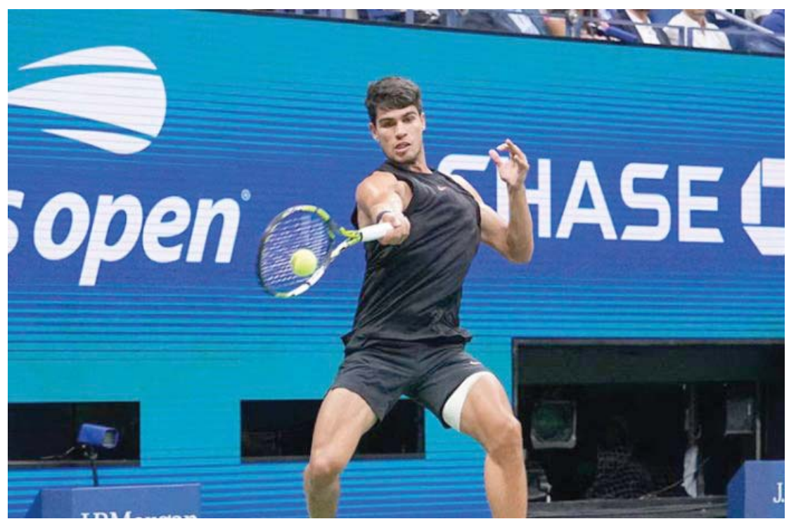
semi-final showdown with top-ranked Australian Open champion Jannik Sinner.

Carlos Alcaraz, who won the first of his four Grand Slam titles in New York in 2022, will face 2021 quarter-finalist Botic van de Zandschulp in the second round, headed toward a possible