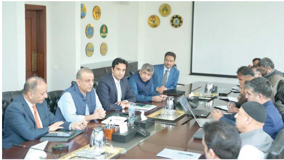
larger scale to ensure the participation of all stakeholders. Chairman Steering Committee and

ISLAMABAD: Prime Minister's Steering Committee for Gemstones held its important session presided by Chairman/Federal Minister Abdul Aleem Khan in which steps for recommended for search for precious stones, separate them from rocks, cut and beautify into gems. Various suggestions for the solutions of problems beings faced were discussed which can help their availability in the market. Steering Committee held a detailed session with private institutions of good reputation related to the business of Games Stones and listened their issues. It was agreed that before finalizing the recommendations, the next meeting will be convened on a