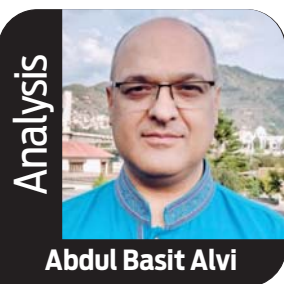
Analysis Abdul Basit Alvi

The community engagement programs and events organized by the Pakistan Army are highly valued by the public. There is a growing need to increase such initiatives to strengthen the bond between civilians and the military, contributing to a more united and prosperous Pakistan through the combined efforts of the Army and its citizens.