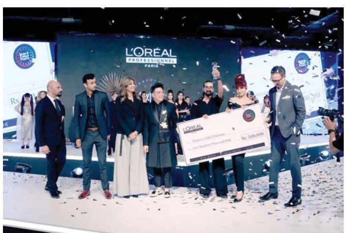
Trophy is a game-changer for the Pakistani beauty industry.