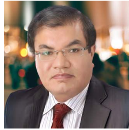
Foreign companies only like to deal with Pakistani companies registered in Dubai because the situation in Pakistan is uncertain, and doing