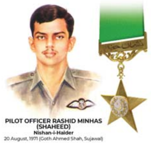
PILOT OFFICER RASHID MINHAS (SHAHEED) Nisham-i-Haider 20 August, 1971 (Goth-Abad Shah, Suiabad)

فرمان رسول ﷺ اور ایسا کر کے نبی کریم صلی اللہ علیہ وسلم اس وقت بیٹھے ہوئے تھے کہ ایک صاحب نے آ کر سوال کیا کہ نبی کریم صلی اللہ علیہ وسلم کی طرف سے جو چیزیں آئی ہیں ان میں سے کون سی چیزیں ہیں جو ہمیں بھی اپنی زندگیوں میں لے کر آنا چاہیے؟ انہوں نے فرمایا کہ تمہارا دل جو چاہے گا اسے لے کر آنا۔ (بخاری، حدیث نمبر 6027) Barkat Rice Mills (Pvt) Limited