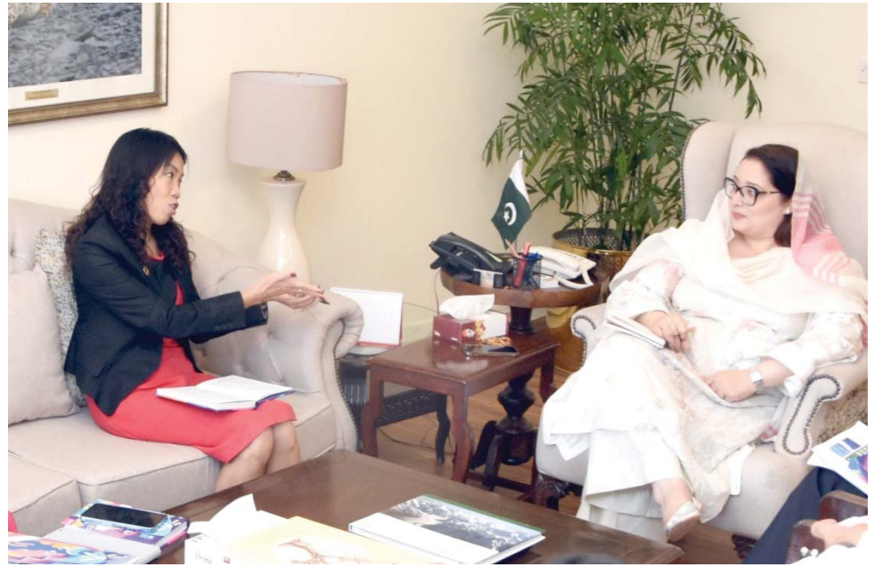
monthly progress review meeting about these projects adding that this government under the leadership of PM was committed to make the country climate resilient.