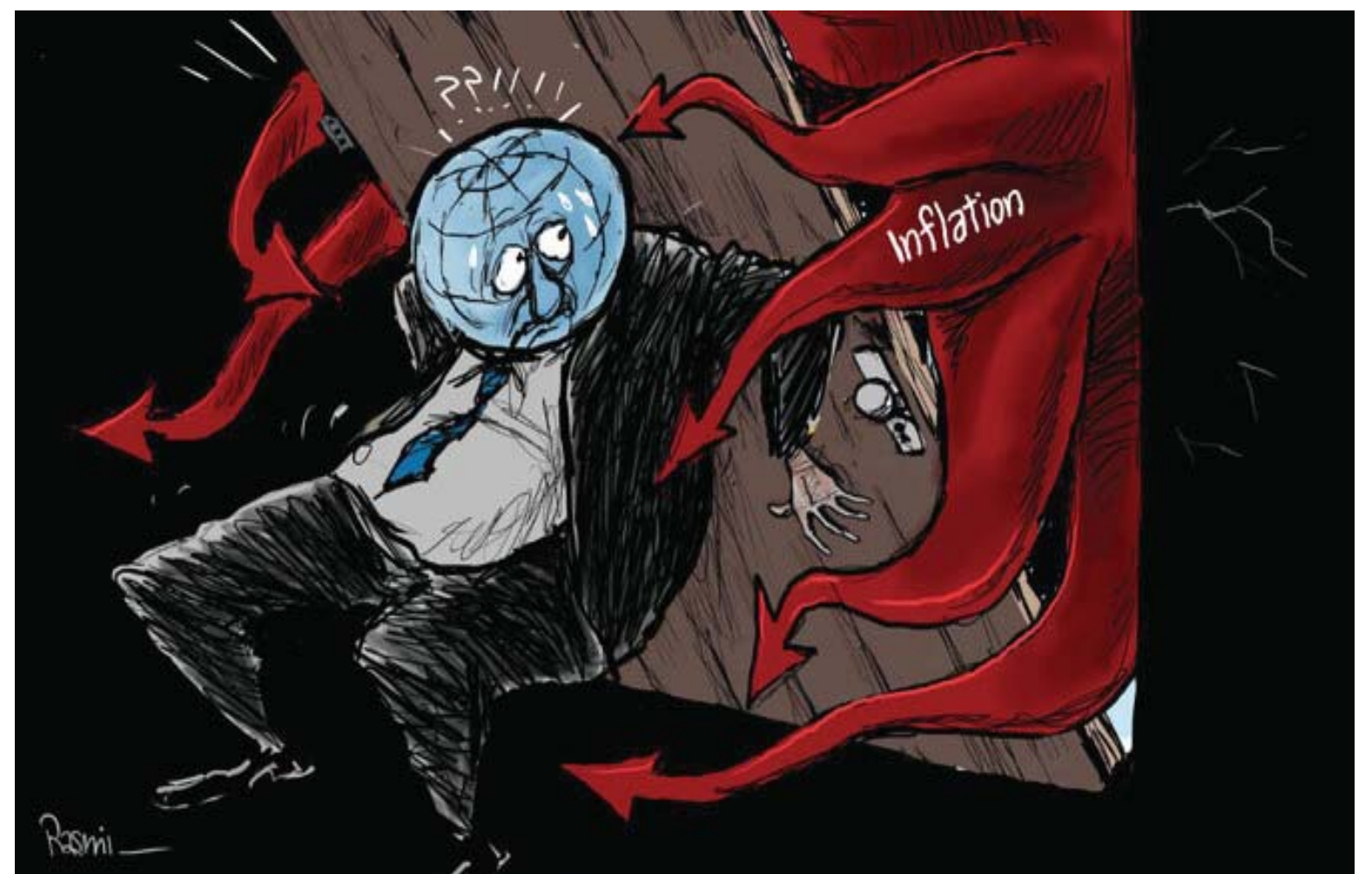
Cartoon by Amjad Rasmī. (Courtesy of Asharq Al-Awsat)

Each year, the commemoration focuses on a theme in efforts to advocate for the survival, well-being and dignity of people caught in crises, and the safety and security of aid workers.