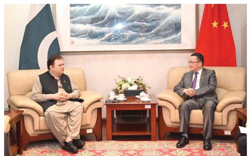
presented shield, souvenir, Blue shall and Mulatni sohan halwa to the Consul General. The Consul General also gave away gifts to the Additional Chief Secretary.