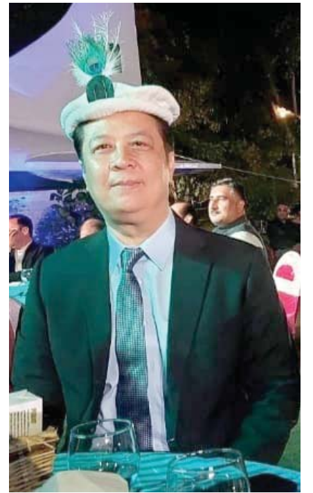
During this visit, the establishment of a joint ministerial commission as well as cooperation in the oil and gas sector was also proposed.

In this visit, the Pakistani side proposed a Preferential Trading Area (PTA) along with a Free Trade Agreement (FTA).