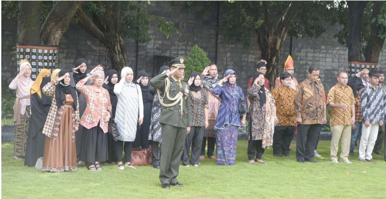
"On behalf of the Indonesian Embassy, I express my sincere gratitude and high appreciation to all of you for joining us at the very special moment of Indonesian Independence Day. Indonesia and Pakistan, the two largest Muslim countries in the world, dosti zindahbad!" he said in the spirits of freedom and

Right after the Ceremony, the Indonesian Chargé d'Affaires escorted all guests of honor to the Embassy's Hall for small and simple reception by serving Tumpeng, the cone-shaped rice dish as an inseparable part of celebrations and other important events in Indonesia.