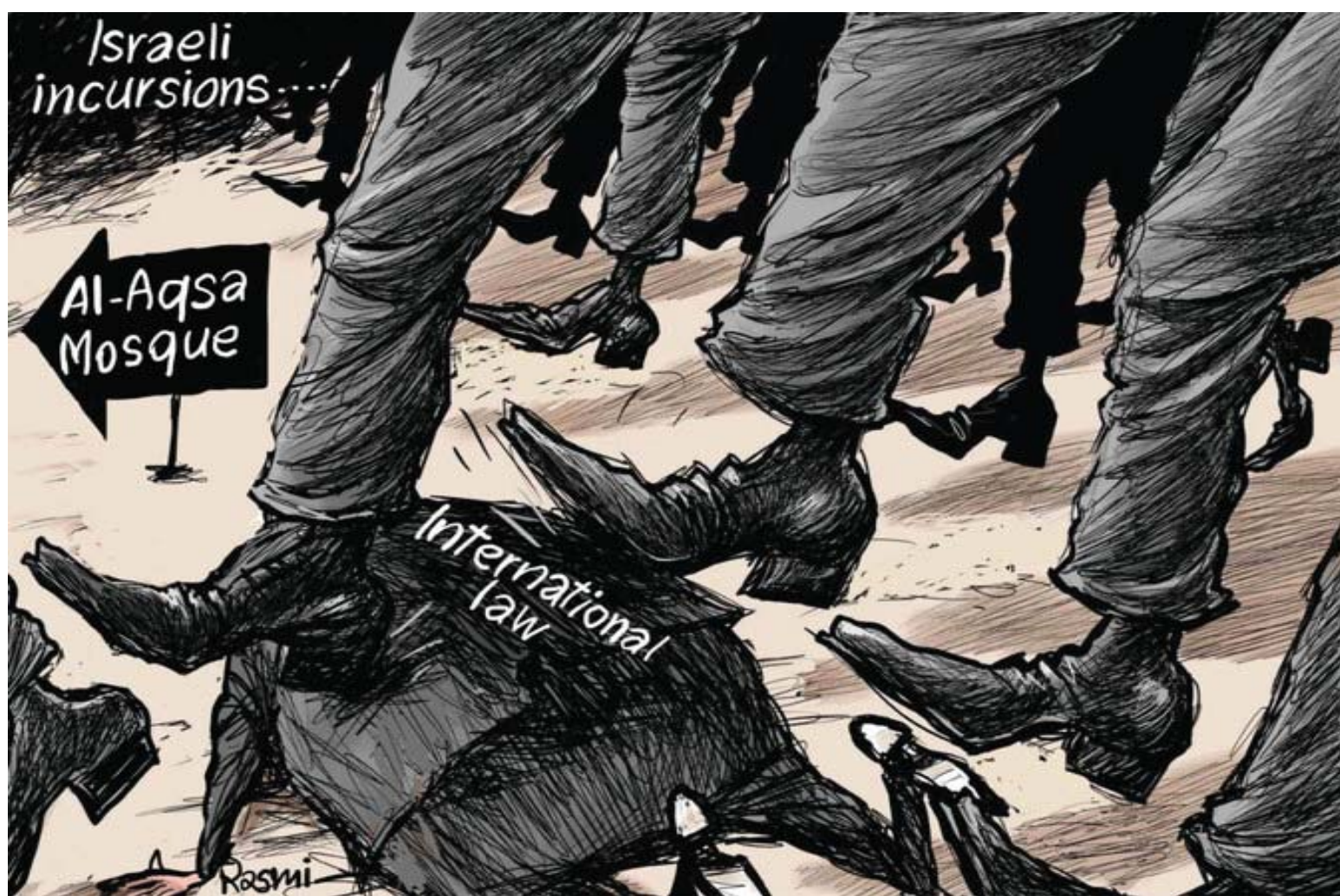
Cartoon by Amjad Rasmī.

The impact of climate-related hazards on child health is exacerbated by how such hazards affect food and water security, damage infrastructure, disrupt services for children, and drive displacement.