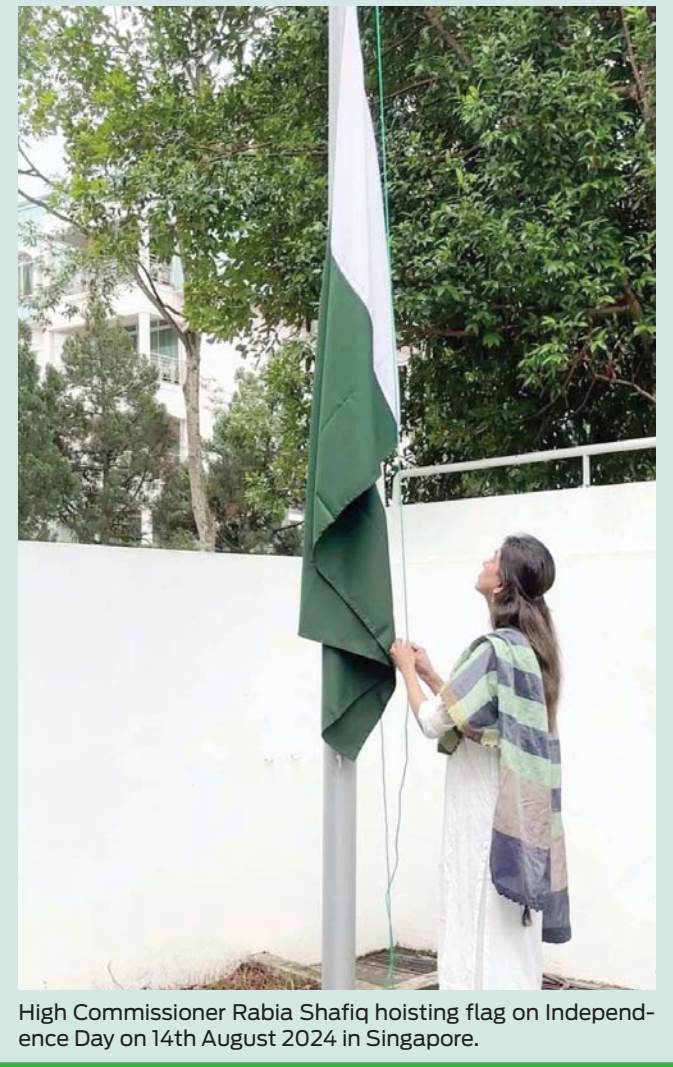
High Commissioner Rabia Shafiq hoisting flag on Independence Day on 14th August 2024 in Singapore.