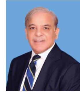
Mian Muhammad Shehbaz Sharif, Prime Minister of the Islamic Republic of Pakistan

PM vows for an inclusive, prosperous Pakistan