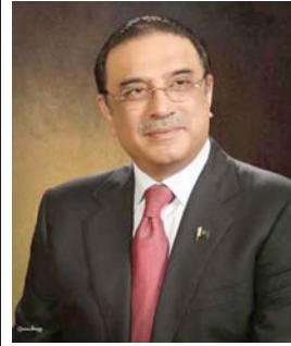
Mr. Asif Ali Zardari, President of the Islamic Republic of Pakistan

Messages on the occasion of the 78th Independence Day of Pakistan