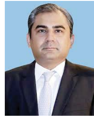
always be remembered.

He expressed that the sacrifices of the martyrs would