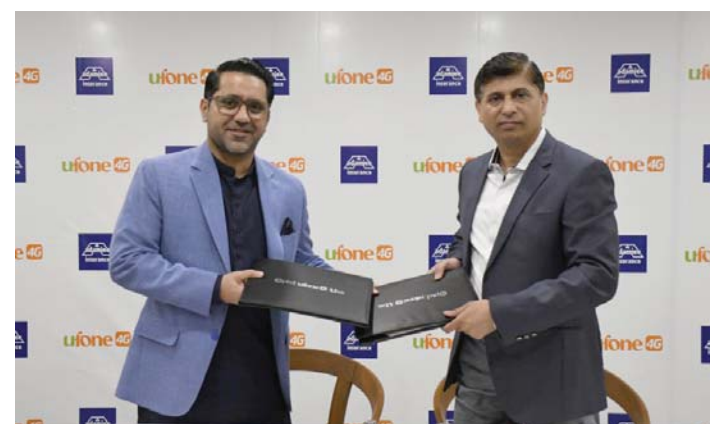
Ufone 4G's mission to uplift its customer facilitation system.

The "Franchise Health Insurance Program" exemplifies Ufone 4G's dedication to its stakeholders, and showcases its commitment to enabling franchisees that deliver exceptional service to customers. The initiative sets a new industry standard for franchise support and loyalty programs in line with Ufone