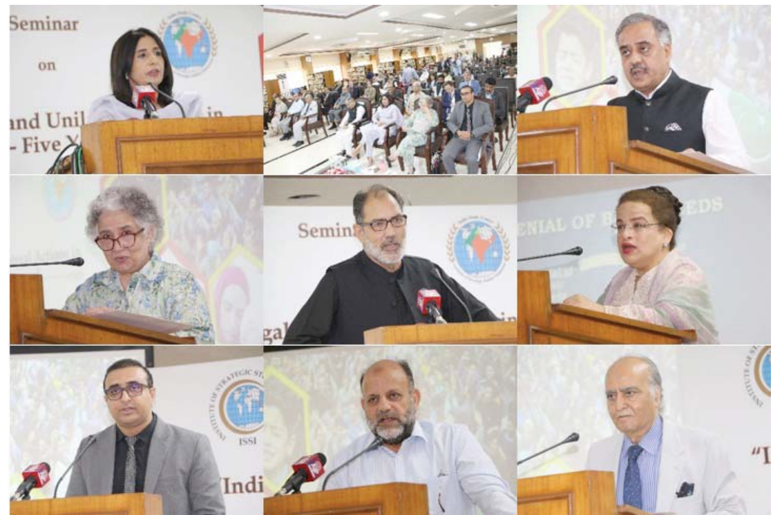
Chairman BoG, ISSI, during which he dilated on the historical perspective of the Jammu and Kashmir dispute and highlighted its legal aspects in light of international law, UN Charter, and relevant Security Council resolutions.