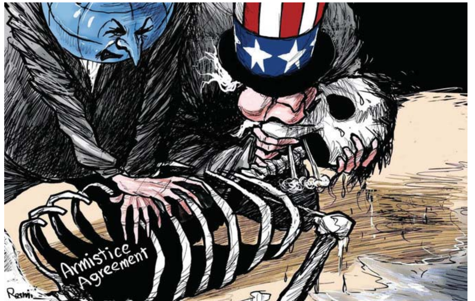
Cartoon by Amjad Rasmī. (Courtesy of Ashraf Al-Awsat)

The Conference culminated with a series of B2B networking sessions and individual meetings, presenting a golden opportunity for enterprises from both countries to delve into potential partnerships and discuss avenues for collaboration.