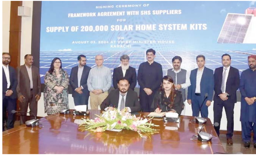
billion with the $100 million financial support of the World Bank.

Murad said that the Sindh Solar Energy Project (SSEP) was being executed for Rs27.4