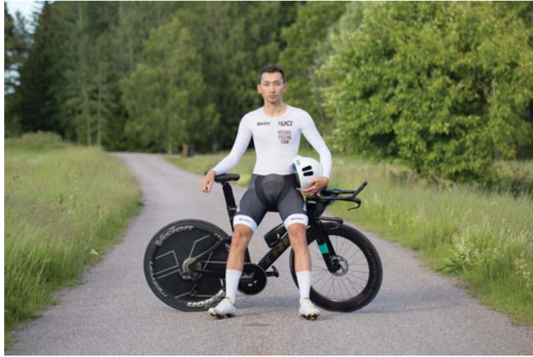
He said the cold and dark journey gave him "depression-plus," so he went back to what he knew as a child—cycling.