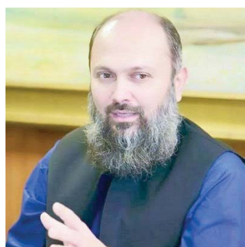
Representatives from the auto industry also voiced their concerns,

Khan acknowledged that the high electricity tariffs have severely hindered the competitiveness of Pakistani industries in the global market, thereby stifling export growth. "We can't compete with the international market and can't increase exports unless we address the issues related to cost of production," Khan emphasized.