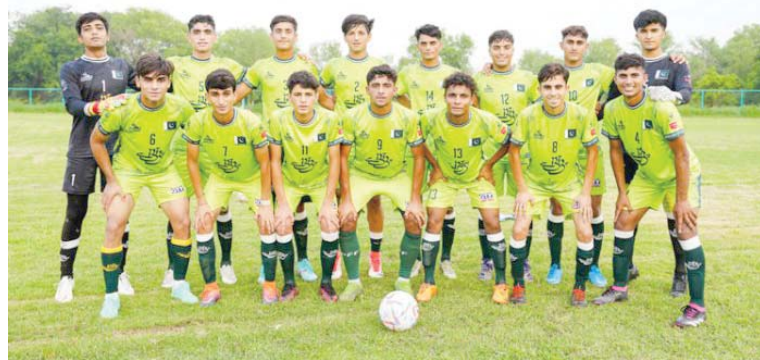
displayed exceptional grit and refrained the opposition from scoring a single goal.

While Pakistan forwards were on a roll against Vardeneset BK, their defence also