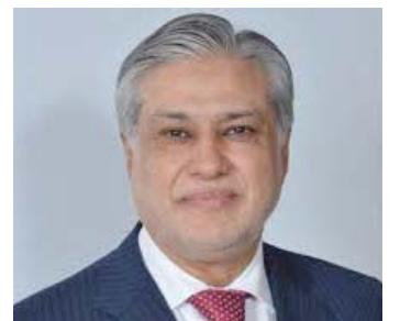
issued by the Foreign Office said.

The visit attests to the commitment by the two countries to strengthen leadership-level engagement and bilateral cooperation, a statement