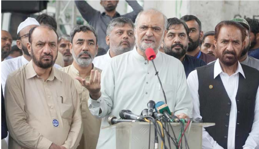
JI. Naeem criticised the government for creating hurdles for the JI women workers in Lahore, adding that it spoke of the government's cowardice. Taking the government to task over capacity payments to the IPPs, the JI emir said

He claimed that no other party could become the true representative of 250 million people of Pakistan, except the