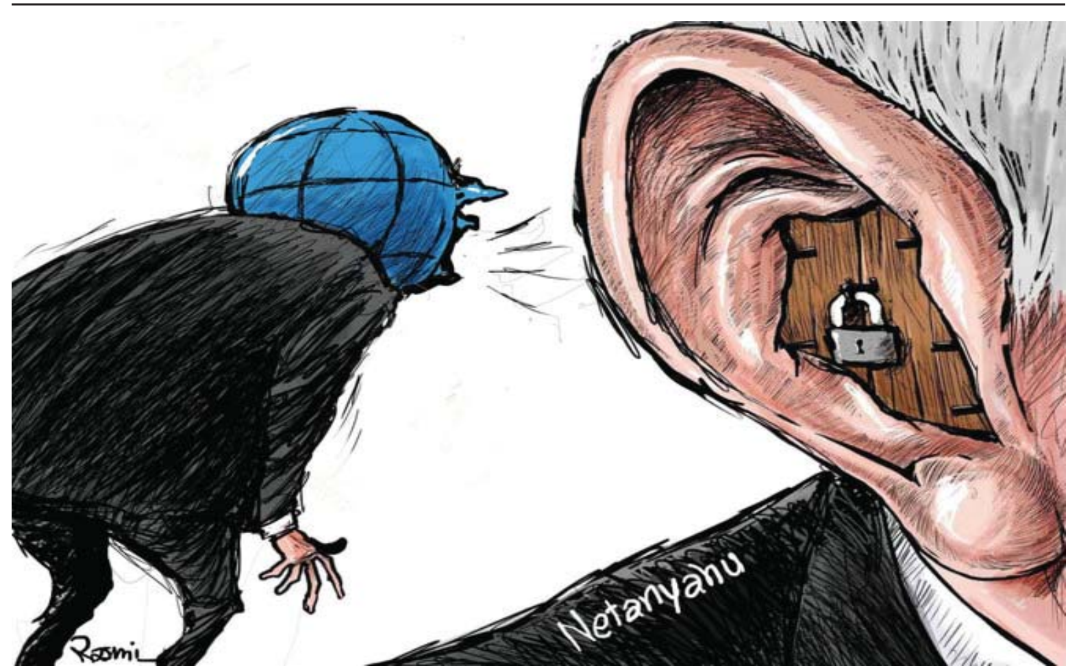
Cartoon by Amjad Rasmī. (Courtesy of Ashraf Al-Awsat)

The economic reasons for global remain a major issue, too: the report found 2.8 billion people couldn't afford a healthy diet in 2022. The contrast between high-income and low-income countries is stark, with just 6.3 per cent of people in the former unable to afford a healthy diet, compared to 71.5 per cent in poorer nations. And although Asia, North America and Europe saw improvements, the situation worsened in Africa.