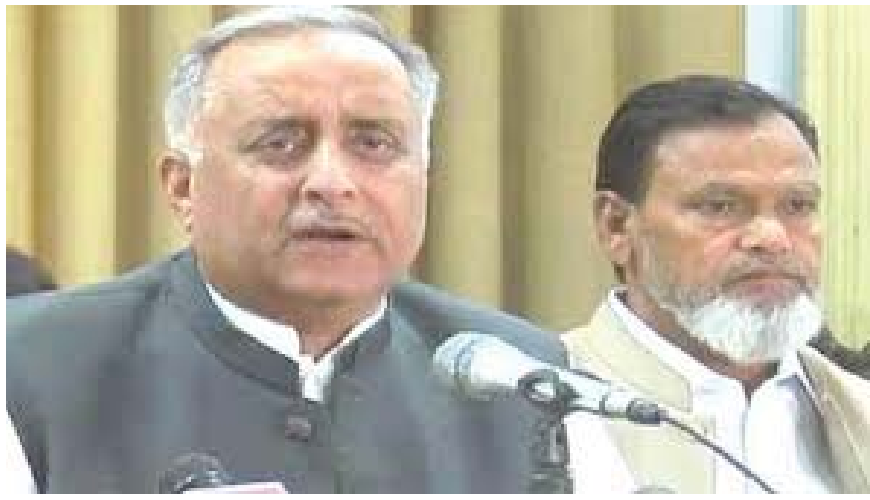
Pakistan. He also mentioned that a 17% GST has been imposed on buffalo feed, and the price of cotton per maund is between 6000 to 7000 rupees,

Chairman Pakistan Kissan Ittehad added that Pakistan's irrigation system has been destroyed, while Indian farmers receive urea at 900 rupees compared to 4700 rupees in