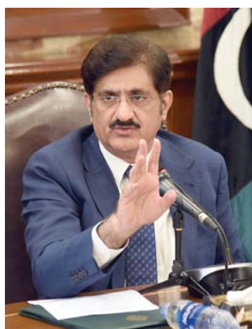
to resolving this issue, and they have issued special directives to work on the solar energy project."

"The Provincial government, as well as the Federal Government, is taking the issue of prolonged power outages seriously," claimed Murad Ali Shah. "President Asif Ali Zardari and Bilawal Bhutto Zardari are committed