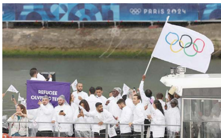
"One hundred years on, the Games are back in our country. And for us, it's a historic opportunity to reinterpret the great hallmarks of the Games to show the world the best of France: its boldness, creativity, avant-garde spirit, and openness," said Paris 2024 president Tony Estanguet. For the first time in Olympic history, the opening ceremony took place outside the host city's main athletics stadium. From the Austerlitz Bridge to

Xinhua PARIS: — After a century-long wait, Paris welcomes back the Olympic Games with a splashy and "Seine-sational" opening ceremony, making itself a truly moveable feast. French President Emmanuel Macron declared the Games open before the waterborne ceremony reached its climax when Teddy Riner and Marie-Jose Perec lit the cauldron with the Olympic flame. The iconic River Seine glistened with cheers and shouts around 7:30pm when the audacious Paris Olympics opening ceremony, featuring global sports stars parading on a flotilla, was finally brought on stream. The French capital, dubbed by Ernest Hemingway as "a moveable feast," was in full flow, celebrating the 100th anniversary of the city's previous Olympic Games and the last edition under the presidency of Pierre de Coubertin, the founder of the modern Olympics.