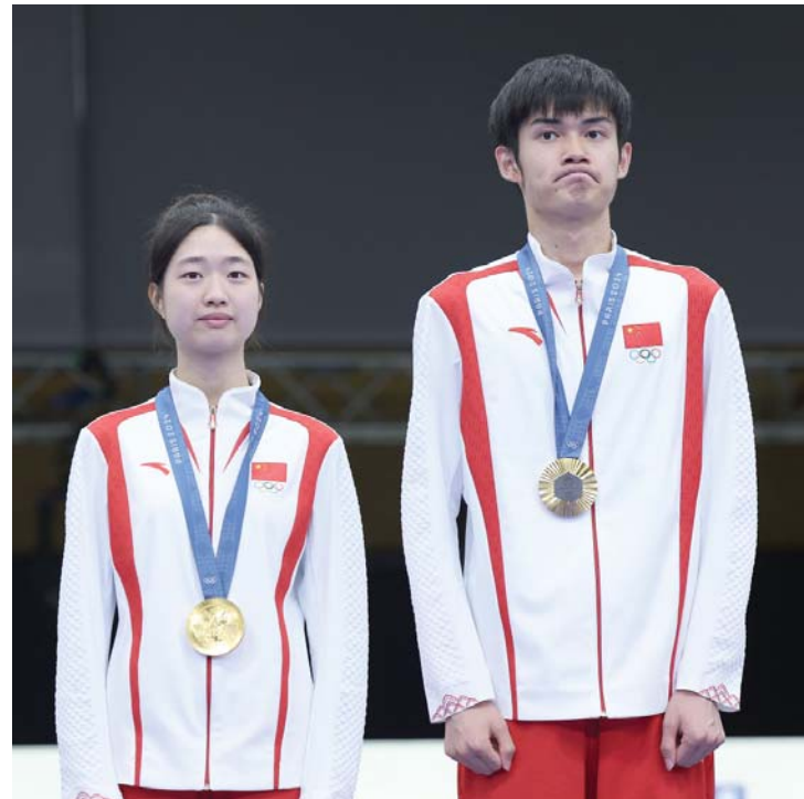
Sheng, meanwhile, is participating in his second Olympic Games, having become the youngest Olympic medalist with a silver in men's 10m air rifle in Tokyo at the age of 16 years and 233 days. In the qualification round, Huang demonstrated remarkable stability, averaging more than 10.5 points per shot. Sheng managed to overcome early fluctuations after a time-out, and the pair finished first with 632.2 points, just one point shy of the Olympic qualification record.

in Baku, Azerbaijan, and at the Asian Games in Hangzhou. They also set a new world junior qualification record with 635.1 points on their way to their fourth consecutive World Cup victory in Munich, Germany, in June before coming to Paris. "The Olympic Games is a rare opportunity in life and also a chance. I must move forward bravely and seize this opportunity, staying persistent, determined, and not giving up during the process, leaving no regrets for myself," Huang said after securing her berth for Paris 2024.