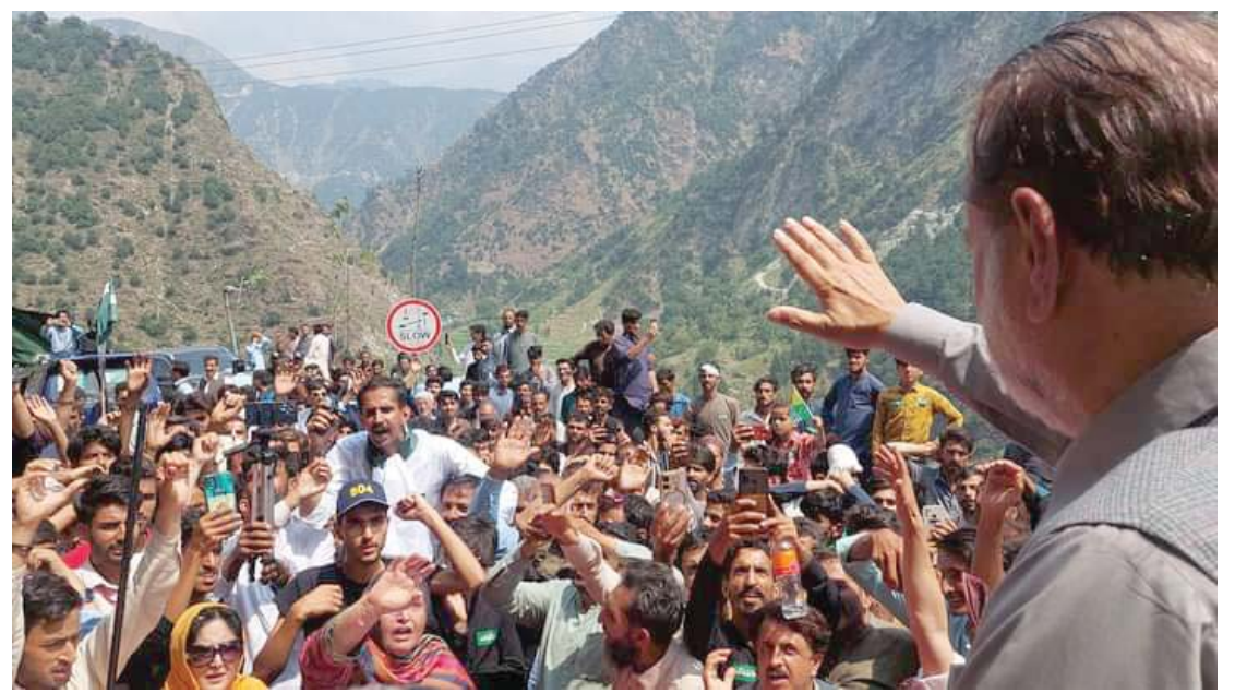
addressed the rally. The success of this rally goes to

The rally took the form of a public meeting where President Muslim Conference Sardar Attique Ahmed Khan and other central leaders