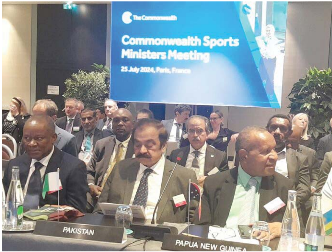
forum on utilizing high-quality physical education and sports to achieve sustainable social outcomes.

Apart from participating in the opening ceremony of the Paris 2024 Olympics and visiting UNESCO headquarters, Rana Sanaullah Khan actively engaged in discussions at the