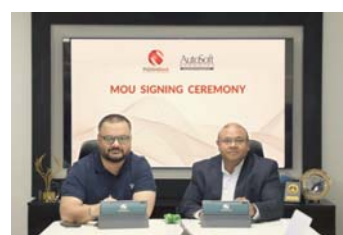
& CEO AutoSoft Dynamics formalized the partnership in Islamabad. The signing ceremony was attended by representatives from both organizations. Sharing his thoughts at the signing