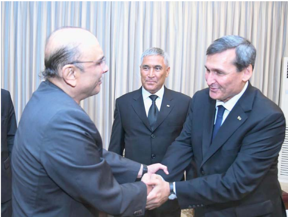
ISLAMABAD: President Asif Ali Zardari welcomed the Deputy Chairman of the Cabinet of Ministers and Foreign Minister of Turkmenistan, Mr. Rashid Meredov, upon his arrival, at Aiwan-e-Sadr, on 23-07-2024.

Welcoming the Minister, the President urged the need to enhance connectivity and communication between Pakistan and Turkmenistan, saying that Gwadar port offered great opportunities for promoting regional trade and Turkmenistan