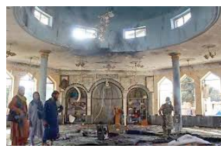
"influenced by misguided ideas."

The Royal Oman Police said the three gunmen were brothers and "were killed due to their insistence on resisting security personnel". It said that police investigations had indicated the three gunmen were