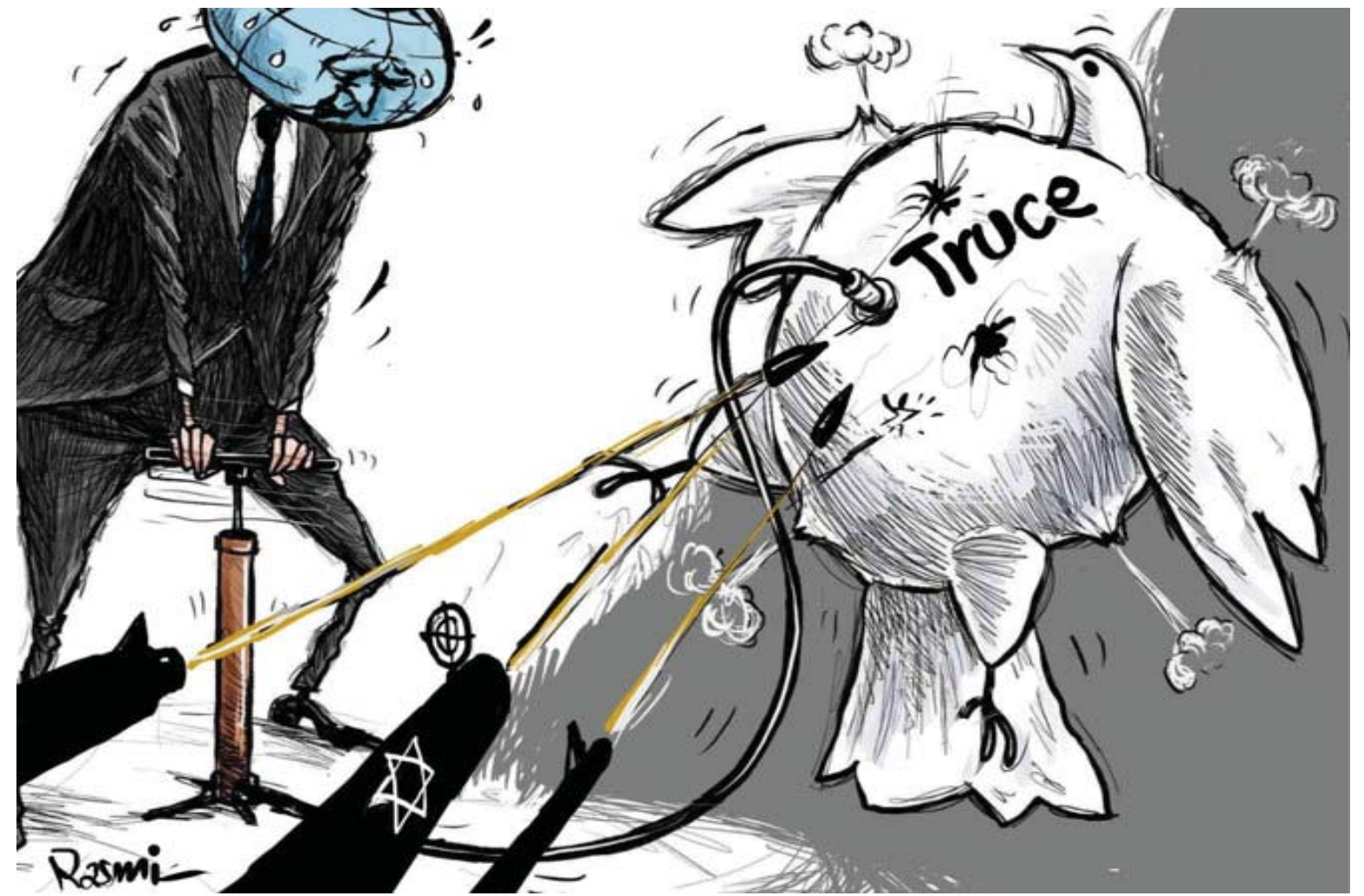
Cartoon by Amjad Rasmī. (Courtesy of Asharq Al-Awsat)

Despite enormous challenges, including shortages of medical supplies and medicines and the destruction of many clinics due to the war, the UN Agency for Palestine Refugees, UNRWA, continues to provide vital health services, working tirelessly to meet the growing health needs of the displaced.