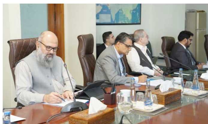
the Commerce Minister's approach. They proposed forming working

The session also saw contributions from Rana Tanveer Hussain, Federal Minister for Industry and Production, and Ali Pervaiz Malik, Minister of State for Finance, Revenue, and Power, both of whom concurred with