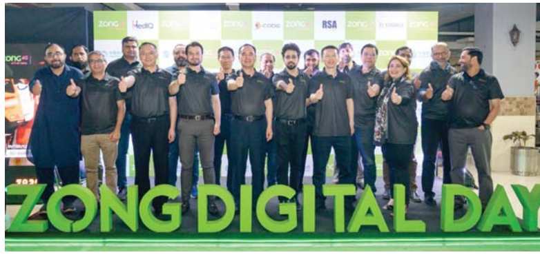
see in Zong.

Taking this direction was imperative to the sustainability, success, and market leadership of Zong. We had to adapt to the changing landscape of technology and the dynamic consumer demands. As we entered a new age of Zong, we also embodied our values of Integrity, Openness, Responsibility, and Excellence. In doing so, we were able to drive growth within and beyond the organization - growth that was crucial to the Sci-Tech transformation we wished to