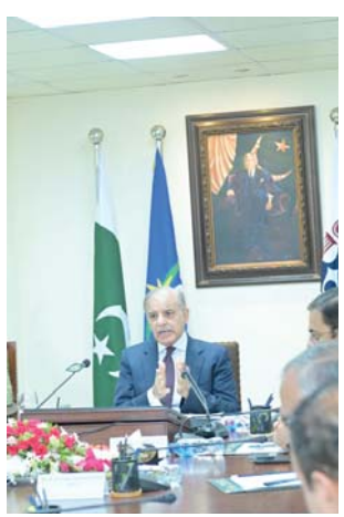
taken for strengthening of the financial and monetary policy

Media Wing, in a press release in Urdu language, quoted the prime minister as saying. The IMF has agreed to extend $7 billion loan to Pakistan, spanning over a period of 37 months. The prime minister observed that the new loaning programme would further strengthen the economy of Pakistan, ushering in a new era of economic prosperity and end to foreign loans. The prime minister thanked the IMF for its support in the difficult times and said that the government was continuing efforts towards strengthening of economy. He said under IMF programme, steps would be