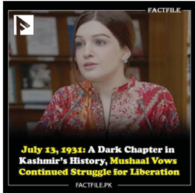
July 13, 1931: A Dark Chapter in Kashmir's History, Mushaal Vows Continued Struggle for Liberation

Mushaal stressed the need for a peaceful and just resolution of the decades-old