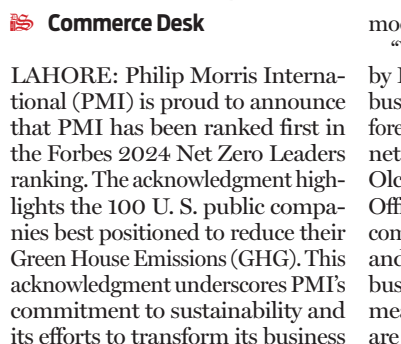
PHILIP MORRIS INTERNATIONAL

build resilience while seizing opportunities presented by a low-carbon future." In 2023, PMPKL's Sahiwal factory generated 15% of its total yearly energy demand from renewable energy. To reduce CO2 emissions, PMPKL introduced barn and furnace improvements to decrease firewood consumption and improved 86% furnaces of its contracted barns. Furthermore, PMPKL installed 5 metallic furnaces successfully at 5 locations during the crop year 2023 which resulted in a fuel saving of 11.54% vs. commonly used venturi furnaces. Through such various initiatives, PMPKL aims to reduce environmental impact and carbon footprint and promote sustainability in Pakistan. PMI continues to push the boundaries of innovation and responsibility. This recognition by Forbes highlights PMI's unwavering commitment to creating a more sustainable world.