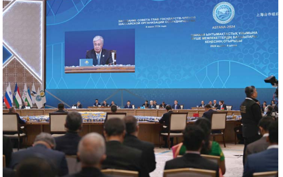
chair and congratulated China echoed the significance of against interference in internal on assuming this position. Shanghai Spirit, urging member affairs by foreign forces.