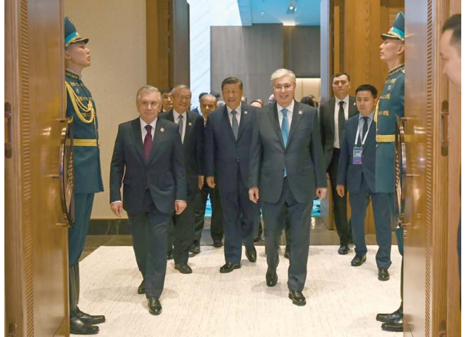
its fruitful work as the SCO President of China Xi Jinping countries to consolidate unity