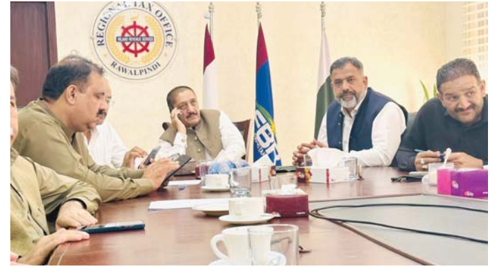
economy, should be imposed fixed tax. The tactics of bringing the businessmen and the government face to face should be avoided, because in this way the purpose of taxation will not be achieved.

lated on the basis of property valuation will not be accepted under any circumstances. Tax is always calculated taking into account the annual income. Income tax is never levied under valuation. The common proposal of the business community is to implement fixed tax. Businessmen across the country should be registered under fixed tax. Regular categories should be created so that the country receives tax and the business community does not face any problem. Which is the annual tax budget of the FBR and which is the target of the country's