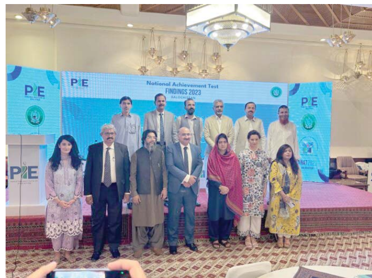
This collaborative effort between Balochistan Examination Commission

By pinpointing areas of strength and areas in need of improvement, the department can develop targeted interventions. This might involve strengthening Math and Science instruction through specialized programs and teacher training focused on identified content domains like Statistics and Probability, which proved challenging for students in both grades.