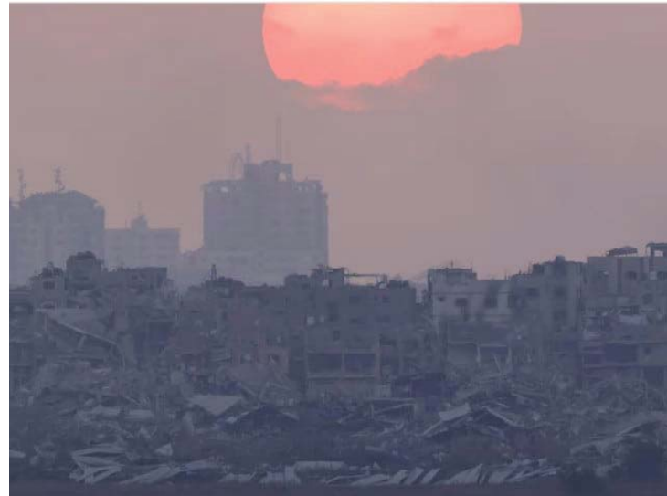
the schools," the military said in a statement.

"In the area, the troops located observation posts, weapons, enemy drones and a long-range rocket launcher near