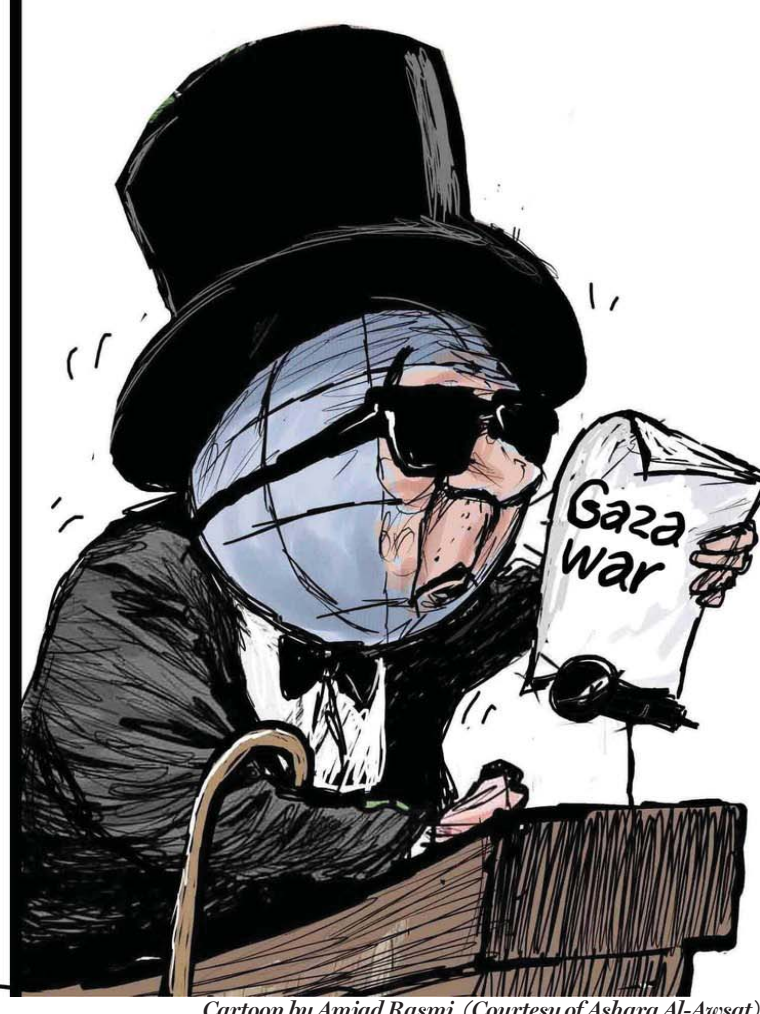
Cartoon by Amjad Rasmi.