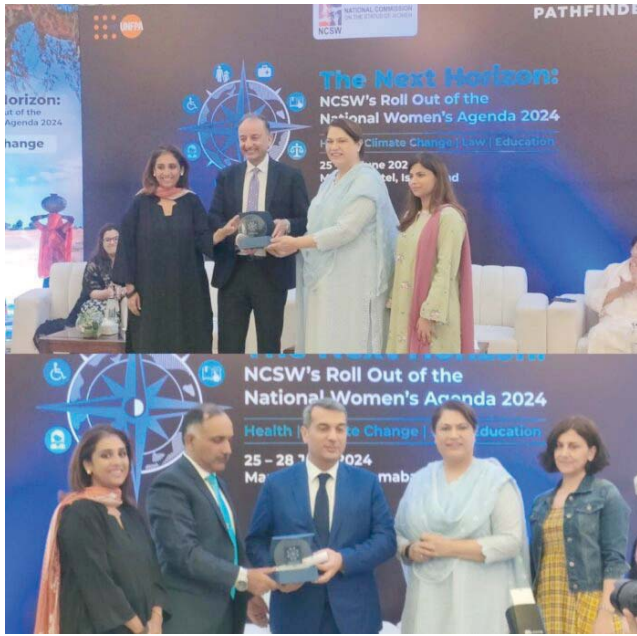
resilience healthcare infrastructure

focus on comprehensive Family Planning and Maternal Health Services. The need to focus on alternative and climate smart agriculture practices, involvement of private sector in early alert system, and women economic resilience was stressed upon.