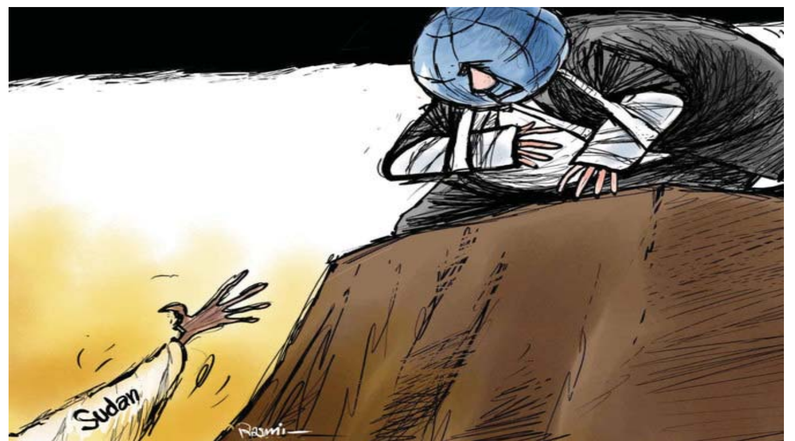
Cartoon by Amjad Rasmi. (Courtesy of Ashraf Al-Awsat)

Furthermore, tech companies should move away from business models that rely on algorithm-driven advertising and prioritize engagement above human rights. Instead, they should prioritize user privacy and safety.