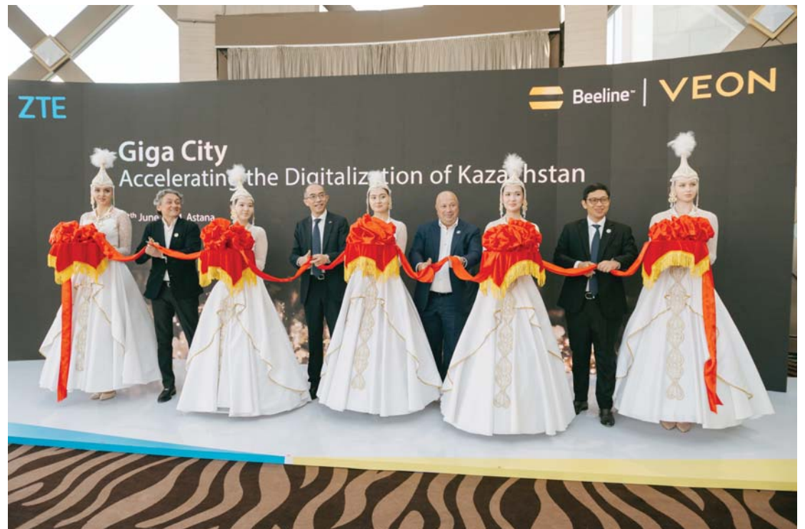
Digital Development, Innovation, and Aerospace Industry of the Republic of Kazakhstan.

The event was also attended by representatives of the Ministry of