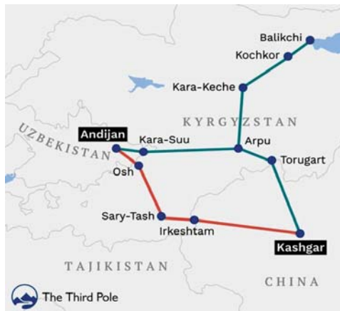
"All three countries have diligently prepared for the construction, which is expected to commence later this year," China Daily reported. The new railway, a beacon of hope and optimism, will

The governments of China, Kyrgyzstan, and Uzbekistan agreed to embark on constructing the new railway at a Shanghai Cooperation Organization summit held in the Uzbek city of Samarkand in September 2022. The project feasibility study was updated following the completion of field surveys by Chinese engineers in December last year.