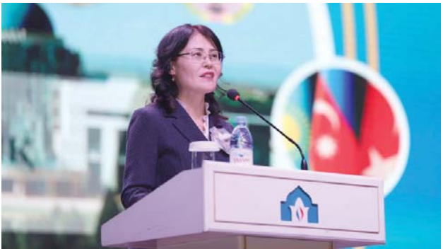
Rector addressing to audience in International Conference, The Golden Horde and Its Legacy (April 25-26, 2024, Turkistan, Kazakhstan)