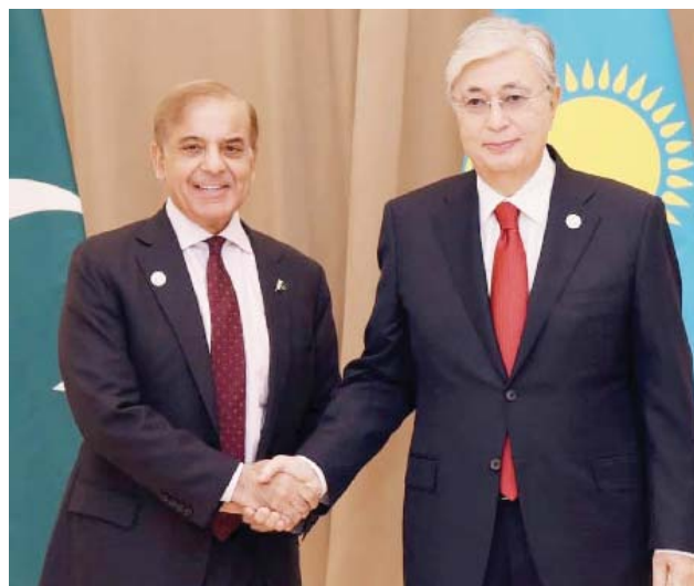
Kazakhstan on 3-4 July, 2024. The Kazakh president expressed his happiness on learning of the prime minister's partic-

While underscoring the significance of regional cooperation, the prime minister said that he looked forward to his participation in the upcoming SCO Heads of State meeting in Astana,