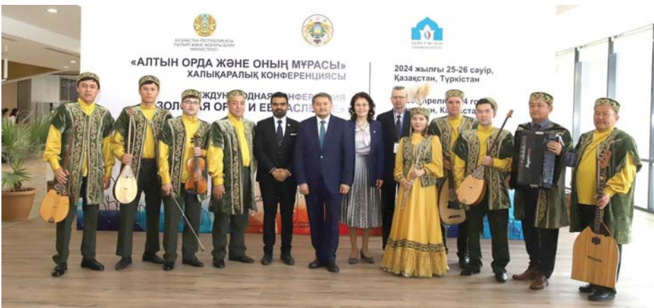
Group photo on the occasion of International Conference "The Golden Horde and Its Legacy", Turkistan, Kazakhstan

The university's development program covering the period from 2024 to 2029 aims to make the university one of the best international educational institutions with a high image and reputation. Through our new strategy, we have identified four main directions that will be prioritized in the coming years, including sustainable institutional development, achieving academic dominance, increasing scientific and innovative potential, and developing a clinical diagnostic center. The university will also move to the