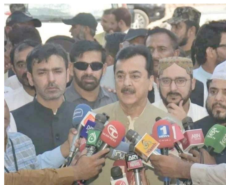
great personalities who gave the draft of the 1973 Constitution to the nation. Chairman Senate said Constitution Day

political leaders and activists Of Pakistan People's Party. Chairman Senate Syed Yousuf Raza Gillani received Eid from political activists and elders and congratulated them on Eid. Speaking on this occasion Syed Yousaf Raza Gillani said that the coalition government is aware of the country's problems, all the political parties have to work together to solve the problems facing the country, the coalition government is trying to deal with the country's problems. He said that he has been trying for the development of Multan before and will continue to play a role for the development of Multan in the future. Regarding the separate province, he said that Pakistan People's Party always struggled for the establish of Saraiki province, we got the bill passed by the Senate, and now we will take more steps for the establish of the Saraiki province by smoothing the public opinion. Besides, Chairman Senate Syed Yousuf Raza Gillani, in his special message on the occasion of Constitution Day, paid tribute to those