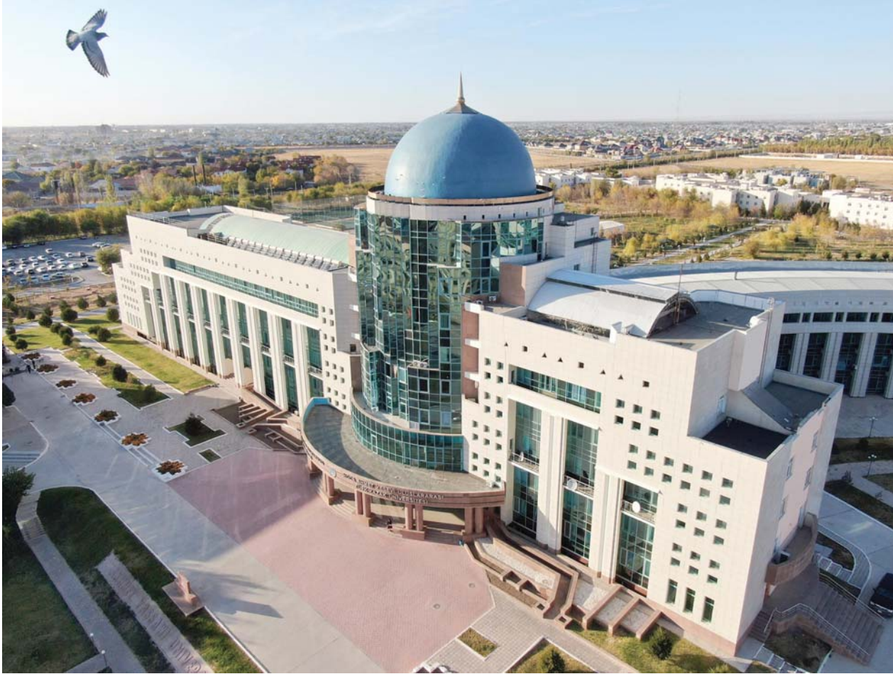
File photo of AKHMET YASSAWI UNIVERSITY, Turkistan, Kazakhstan

Adding further she said with a humble beginning, our university has grown exponentially.