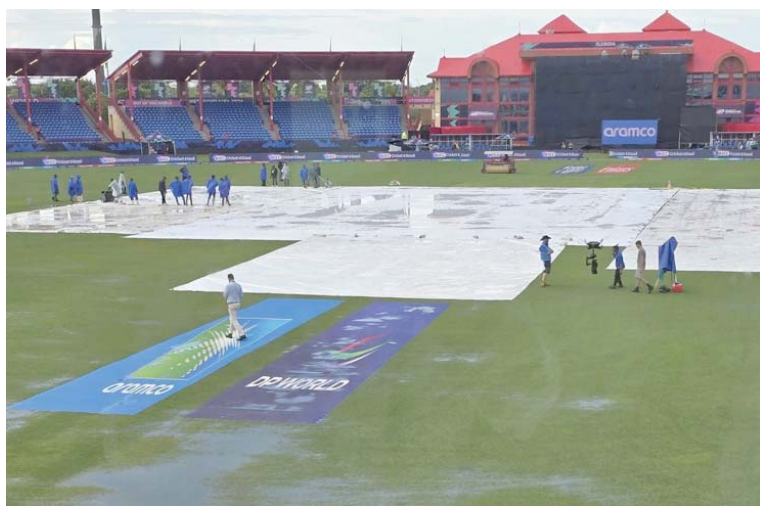
T20 World Cup 2024 campaign as they suffered a shocking defeat at the hands of the USA in the Super Over. The Green Shirts then succumbed

Pakistan had a disastrous start to their