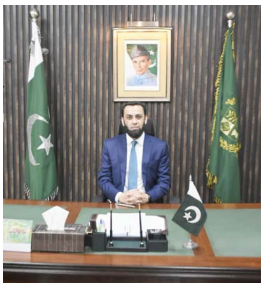
The minister requested the All Pakistan News-

Addressing a ceremony regarding launch of the health insurance scheme for the journalists, the minister said the government had been playing its due role for the welfare of journalists community and he had personally requested the prime minister to take more initiatives in that regard.