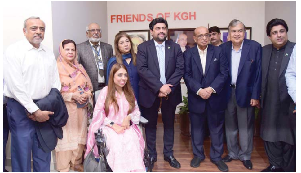
Sindh Kamran Tessori distributed laptops among the position holders of the School of Nursing Kharadar General Hospital for and congratulated the staff of their excellent medical services.