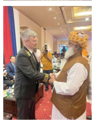
Islamic Cooperation," the ambassador said.