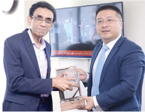
people and offered the support of the Ministry for the setting

He appreciated Huawei's resolve to train 200,000 young