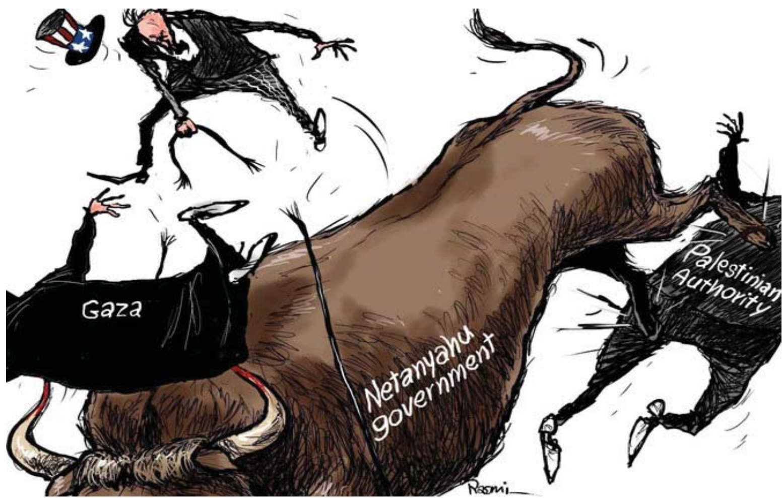
Cartoon by Amjad Rasmi. (Courtesy of Ashraf Al-Awcat)