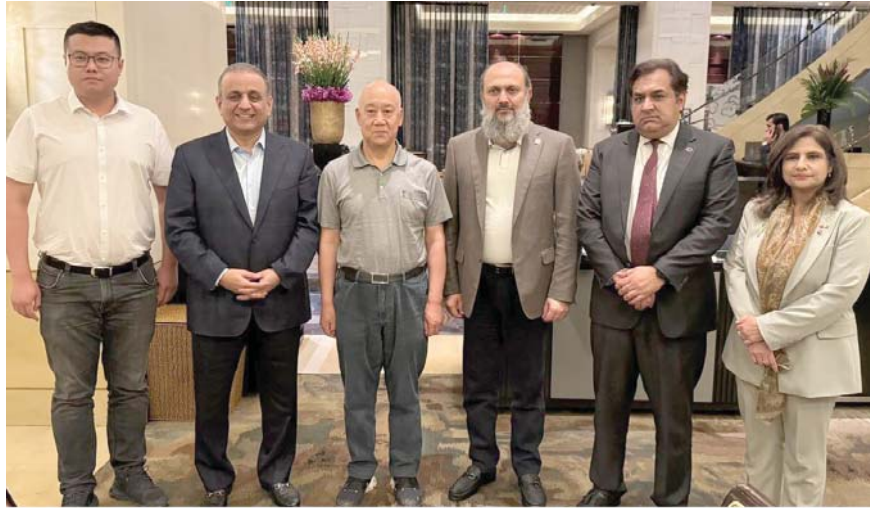
Aleem Khan told that for the encouragement of investors Pakistan Business Portal is also being established rapidly. Federal Minister Abdul Aleem Khan further said that unnece-

Federal Minister Board of Investments, Privatization & Communications Abdul Aleem Khan, while discussing the joint venture with China Service Group, said that his Ministry is introducing unique features such as Ease of Doing Business and "One-Stop Shop" in the Ministry of Board of Investment. Abdul