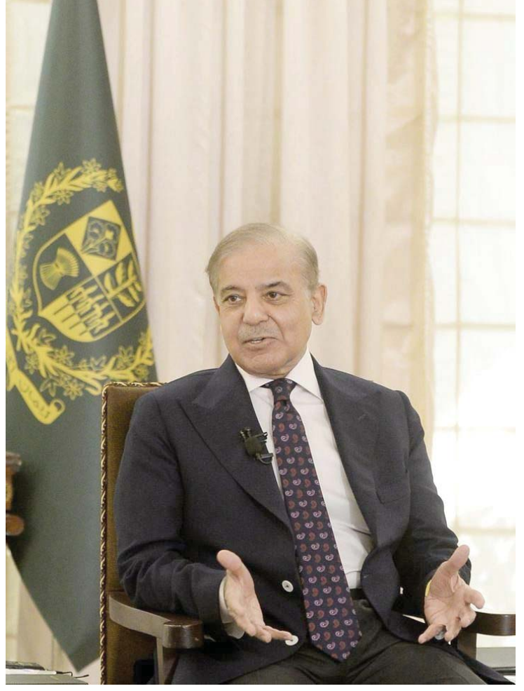
"Despite the hot weather, it still doesn't match the warmth of our hearts," said the prime minister.

Highlighting the role of youth in cultural exchanges, Sharif said Pakistan is actively encouraging its young people to learn the Chinese language and study in China, and will create a favorable environment for Chinese tourists to visit Pakistan for exchanges and coop-