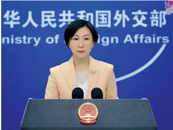
two countries will have an in-depth exchange of views on China-Pakistan relations and issues of mutual interest, and jointly draw up a blueprint for the growth of bilateral relations. In addition to Beijing, Prime Minister Sheh-

Mao Ning: This is Prime Minister Shehbaz Sharif's first visit to China after the new Pakistani government came into office this year. During his visit, President Xi Jinping, Premier Li Qiang and Chairman of the Standing Committee of the National People's Congress Zhao Leji will meet or have talks with him. The leaders of the