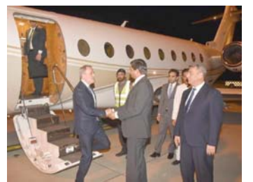
Muhammad Shehbaz Sharif and hold extensive discussions with Deputy Prime Minister and Foreign Minister Senator Mohammad Ishaq Dar.

Foreign Minister Jeyhun Bayramov will call on Prime Minister