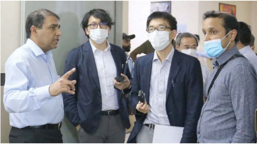
and discuss future collaborations for better healthcare delivery at Children's Complex Hospital Multan.

The purpose of JICA's visit was to ascertain the current challenges