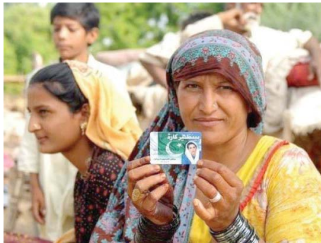
"We ensure fair and transparent disbursements, and deserving women receive their due stipend without any hassle." A total of 228,755 deserving families in Karachi and Hyderabad received their quarterly financial assistance of Rs 10,500 each, along with their educational stipends, under the fourth quarter of the fiscal year 2023-24. The BISP administration established 34 camp sites in eight districts of Sindh, providing transparent and convenient disbursements. Basic facilities, including clean drinking water, seating arrangements, and shade, are available at all camp sites.

KARACHI: The Benazir Income Support Program (BISP) Sindh has disbursed Rs 633.979 million to 60,379 deserving women in eight districts of Sindh province under the Benazir Kafalat program. The disbursements were made during the first phase of the program, which covers eight districts in Sindh, including seven districts of Karachi Division and Hyderabad. The BISP administration ensured transparent and efficient disbursements without any deductions through camp sites set up in the respective districts. "The Benazir Kafalat program empowers women and supports low-income families," said Director General BISP Sindh, Zulfiqar Ali Sheikh.