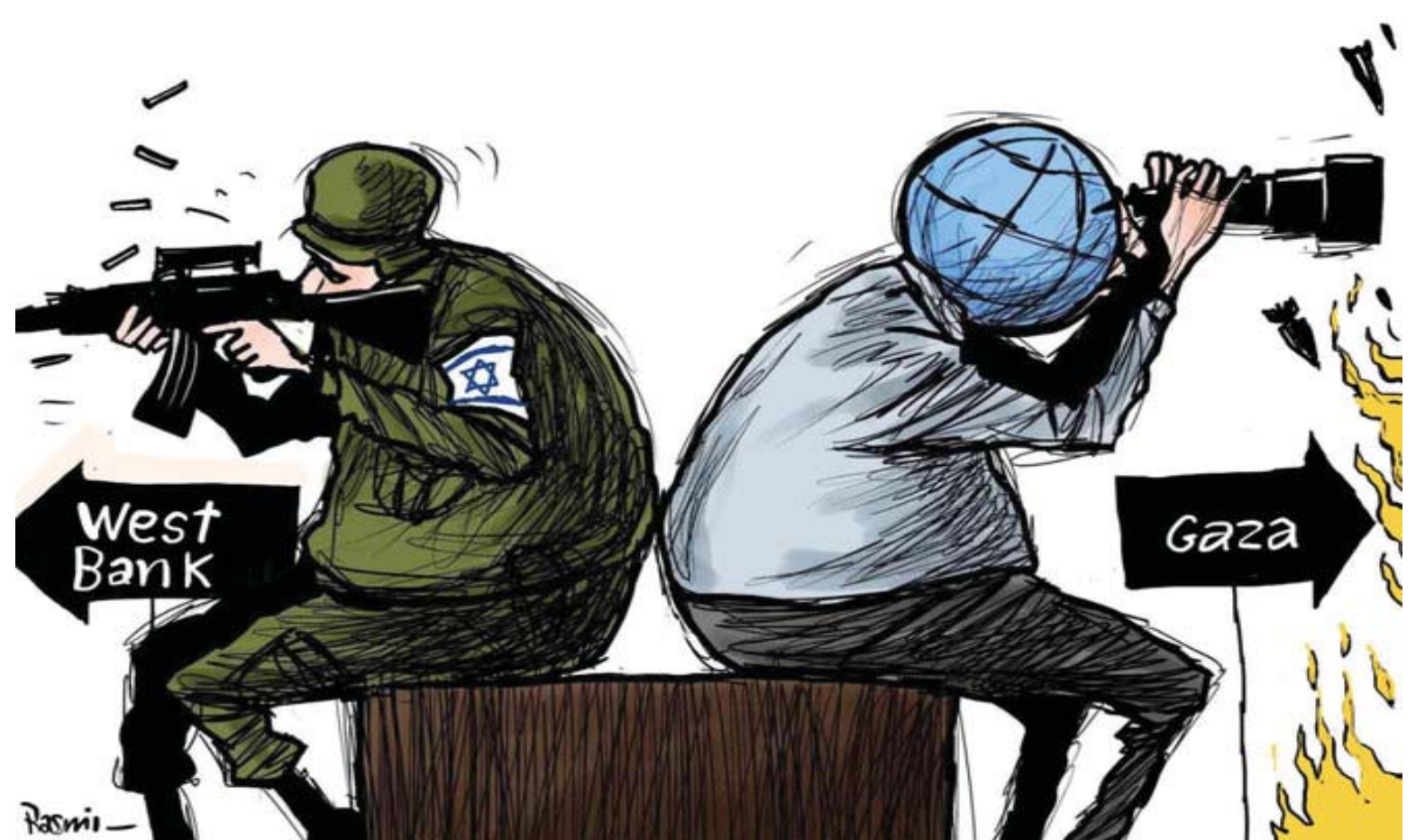
Cartoon by Amjad Rasmi. (Courtesy of Asharq Al-Awsat)