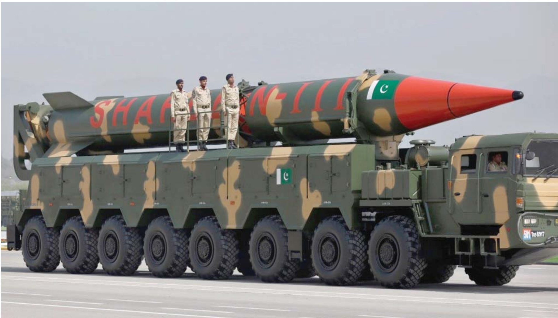
A Pakistani-made Shaheen-III missile, that is capable of carrying nuclear warheads, is carried on a trailer during a military parade in connection with Pakistan National Day celebrations, in Islamabad.

In summing up the illustrious career and profound impact of Dr. A. Q. Khan, it is imperative to distinguish the indelible mark he has left on Pakistan's scientific and defense landscape. His pioneering efforts in advancing the nation's nuclear capabilities have not only fortified national security but also instilled a sense of pride and self-reliance within the country. Beyond his scientific achievements, Dr. Khan's dedication to education and research has inspired countless young minds to pursue excellence in science and technology. As we pay tribute to this visionary scientist, let us remember his legacy as a testament to the power of determination, innovation, and unwavering patriotism. Dr. A. Q. Khan's contributions will continue to resonate for generations, ensuring his place in history as one of Pakistan's most revered figures.