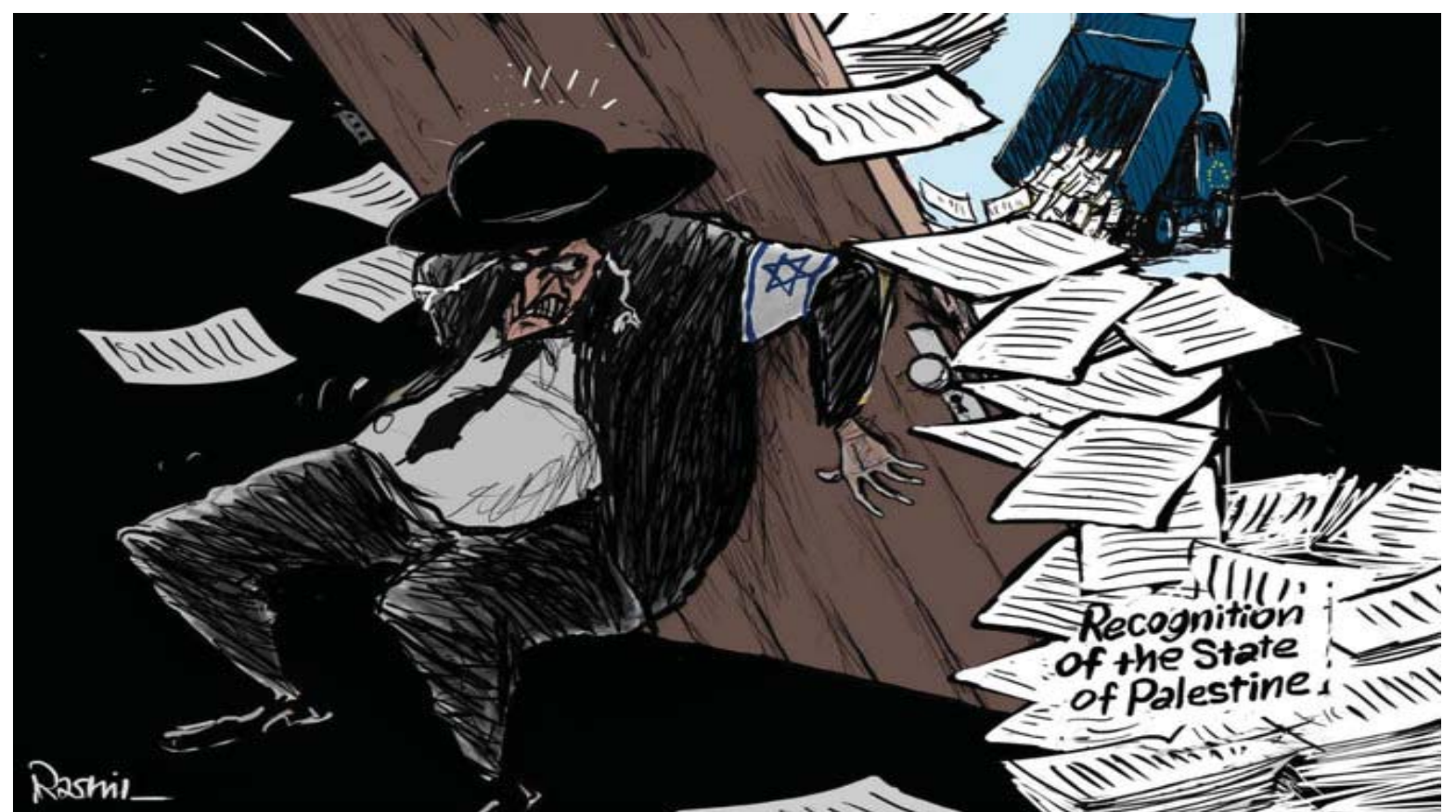
Cartoon by Amjad Rasmī. (Courtesy of Ashraf Al-Awsat)