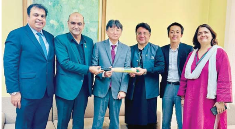
In terms of sports, the Olympic Games have an authentic and prominent place around the world and softball is part of the 2028 Olympic Games to be held in the city of Los Angeles, USA.

Japanese Consul General Hattori Masaru said that softball is played by more than 65 million people from 140 countries around the world.