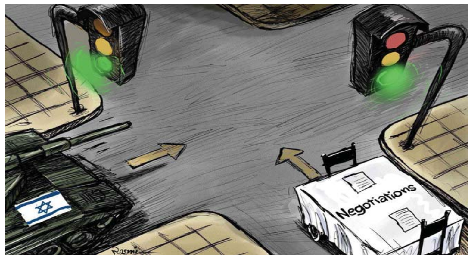
Cartoon by Amjad Rasmī.